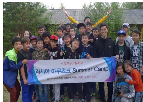
Summer camp in Yakutsk, Russia