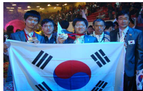
A gold medal winner in the 2009 International Youth Skill Olympics