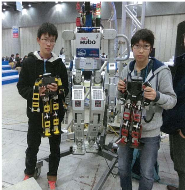
DRC champion robot with us !